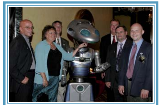
Alcoa Impact Awards

"Millennia" is also a powerful 'educational tool' for events, and always proves to be a major 'media magnet'! Very significant profit center' for events.