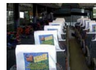
Custom Headrest Cover (shuttle buses)